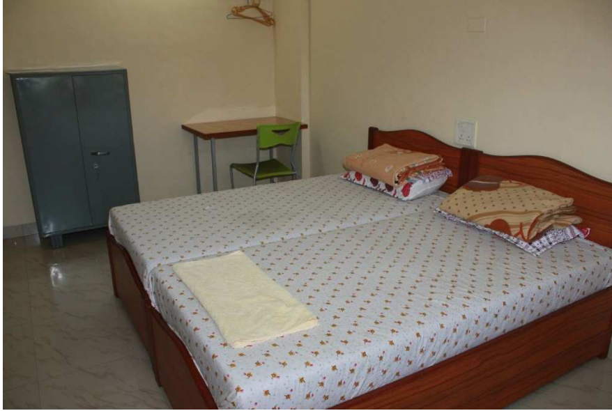
Sample room of hostel.