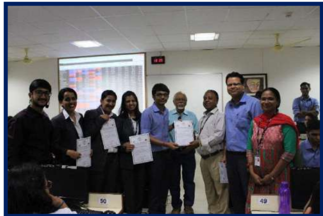
Participants of the day