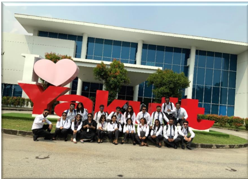
International visit to Yakult Industries, Singapore