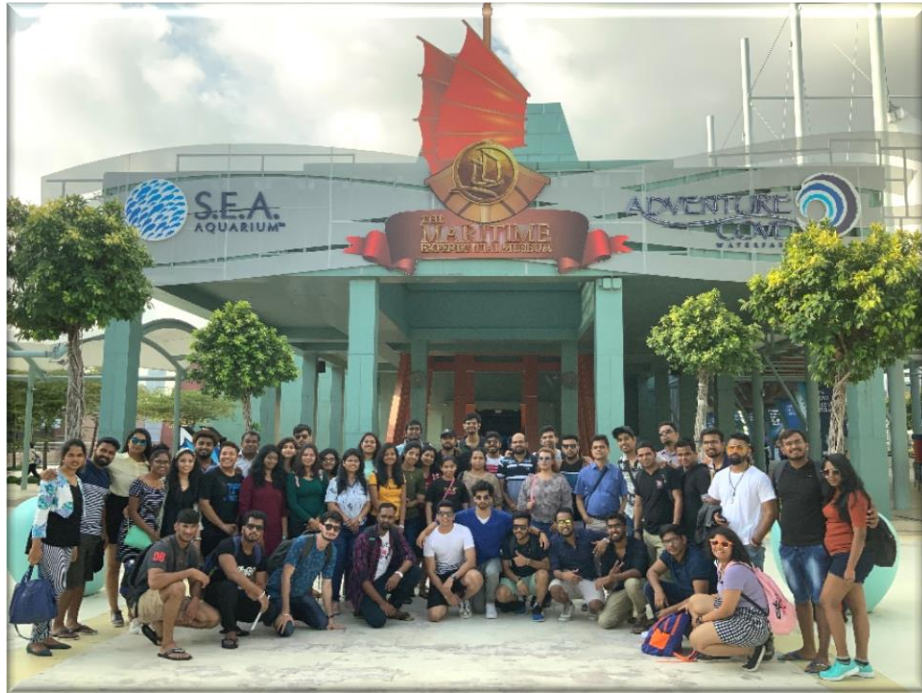
Visit to S.E.A. Aquarium, Singapore