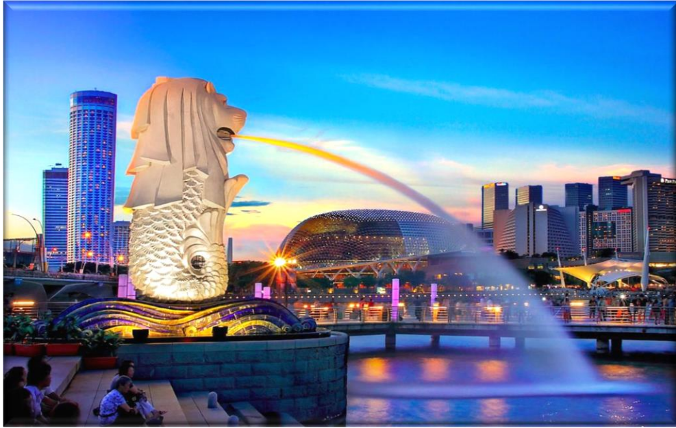
Sight Scene at Singapore tour