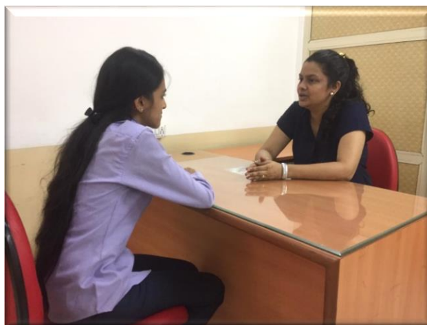
Counselling Centre with Professional Experts to take care of student's well-being.

In the weekly timetable special slots are reserved for counselling facilities. Students who wish to take advantage of this facility can meet counsellor at that spot. In case of emergency they can take appointment of counsellor on the same day.