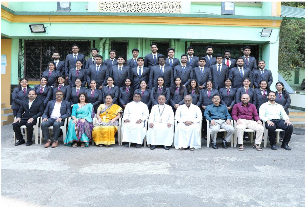
PGDM Batch 2019-21

Out station candidate can make the fees payment by NEFT/RTGS.