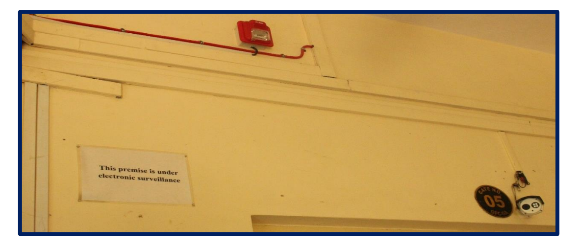
CCTV Camera and Fire Alarm Installed

Fire Alarm, Fire Extinguisher and CCTV Surveillance in SFIMAR Campus