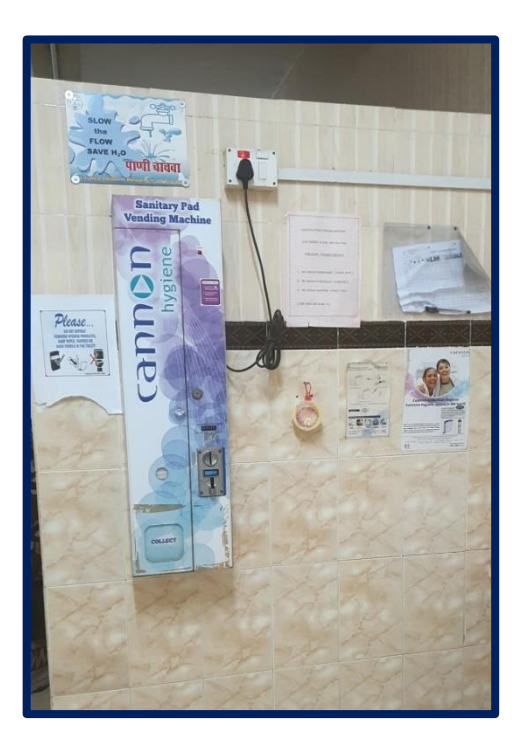
Canon Sanitary Pad Vending Machine