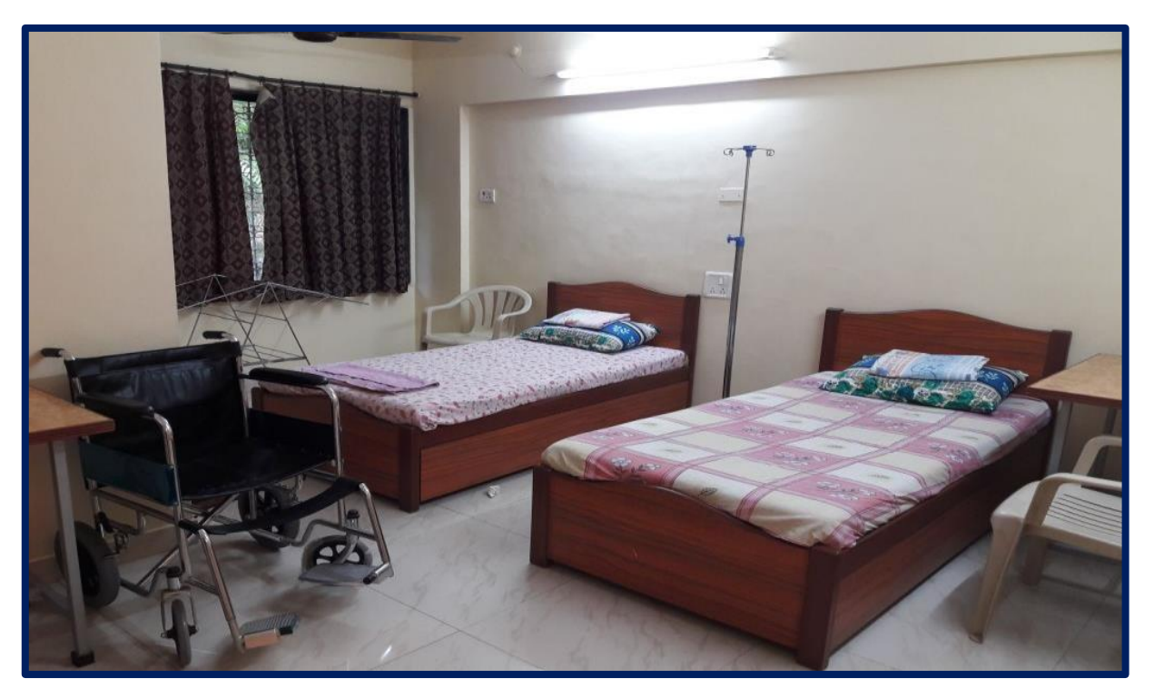
Sick Room in SFIMAR Campus