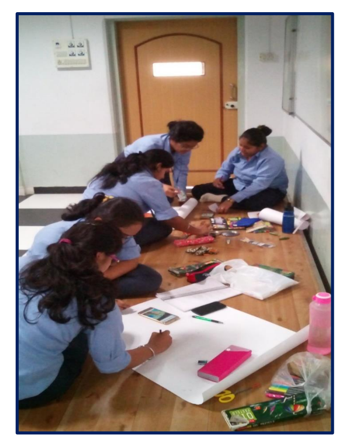
Poster Making Competition on Social Issues Related to Women organized by DLLE