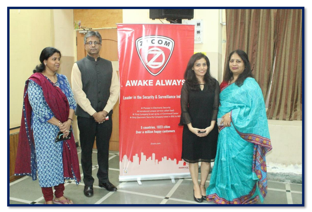
Awareness Programme organized by CWDC in association with ZICOM for