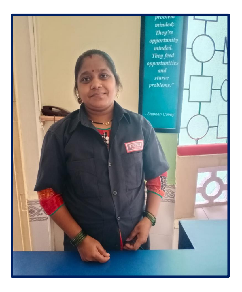
Lady Security for the welfare of the female students