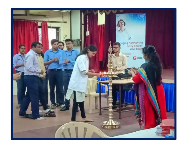
Health Check-up Camp in Association with Wockhardt Hospital, Mira Road