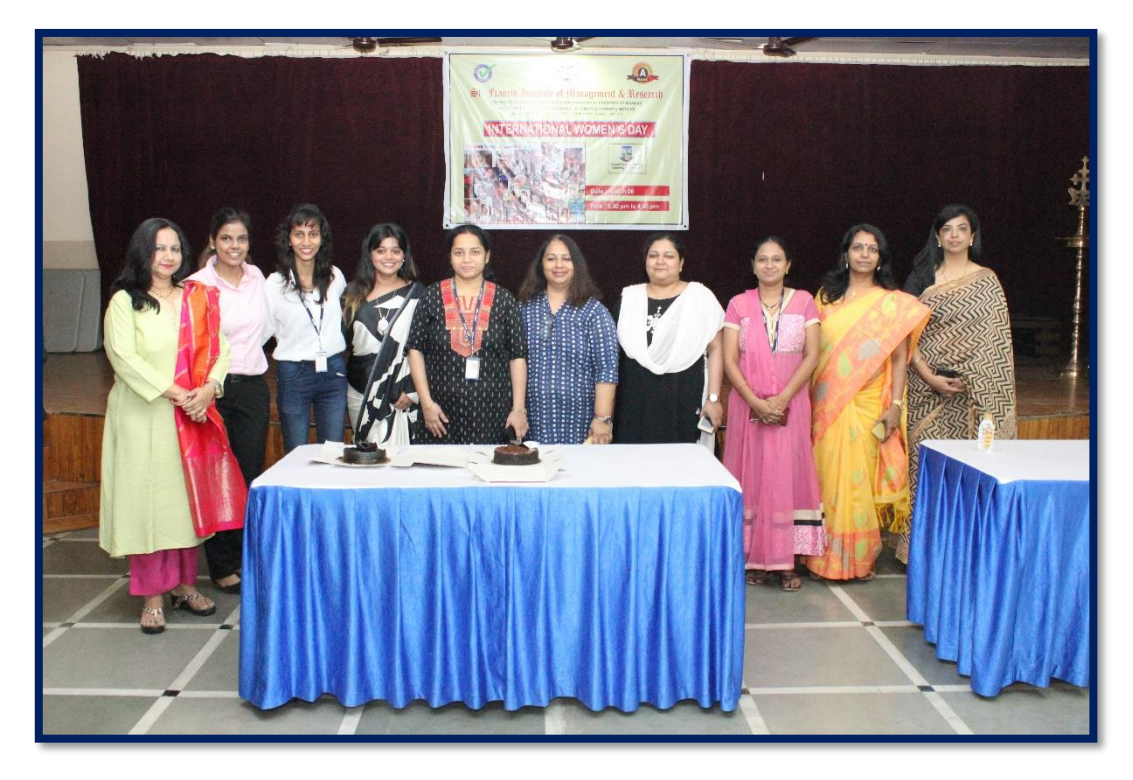
Celebration of Women's Day in the Academic Year 2018 – 19