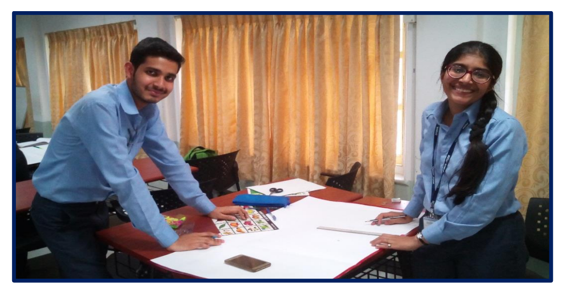
Poster Making Competition on Social Issues Related to Women organized by DLLE in the Academic Year 2017 – 18