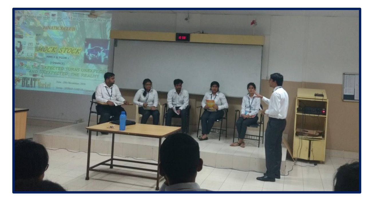
CCTV installed in Classroom