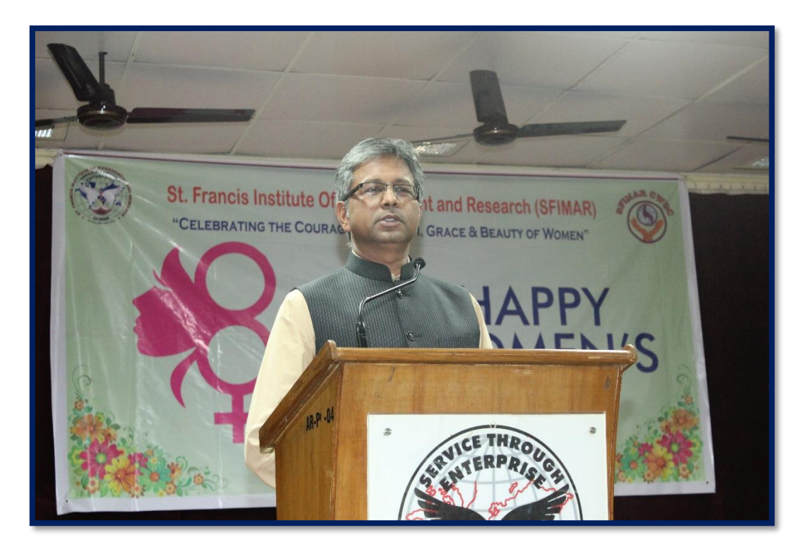
Awareness Programme organized by CWDC in association with ZICOM for