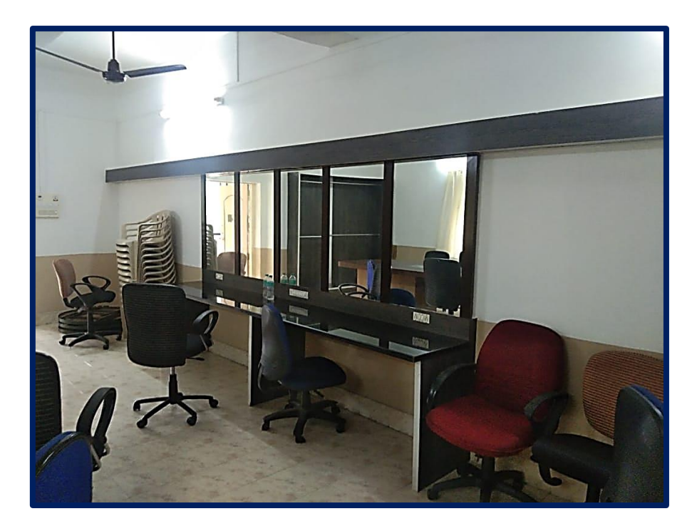
Girls Common Room