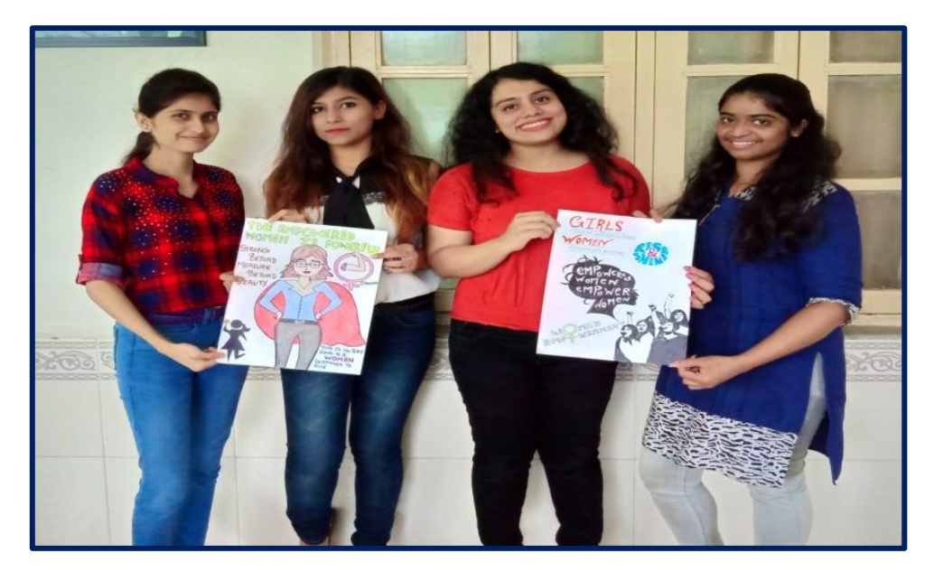
Poster Making Competition on Social Issues Related to Women organized by DLLE