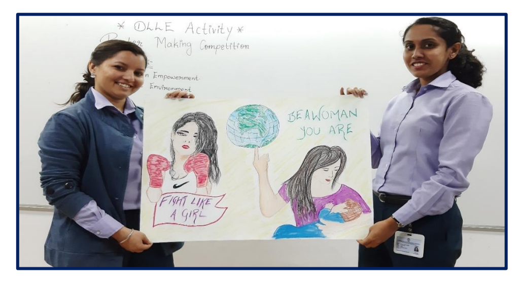
Poster Making Competition on Women Empowerment organized by DLLE on 20.1.20