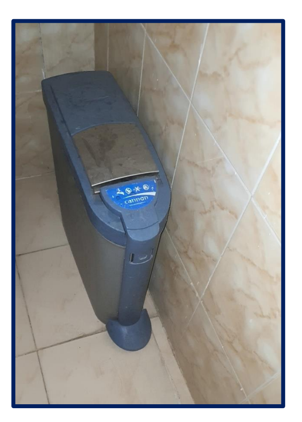
Canon Feminine Hygiene Care Unit