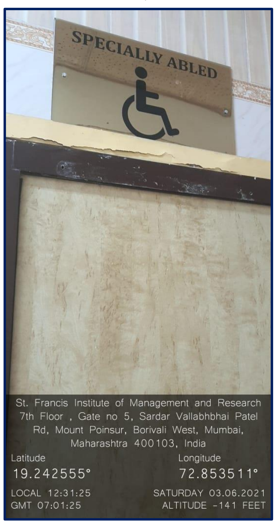
Disabled Friendly Washrooms