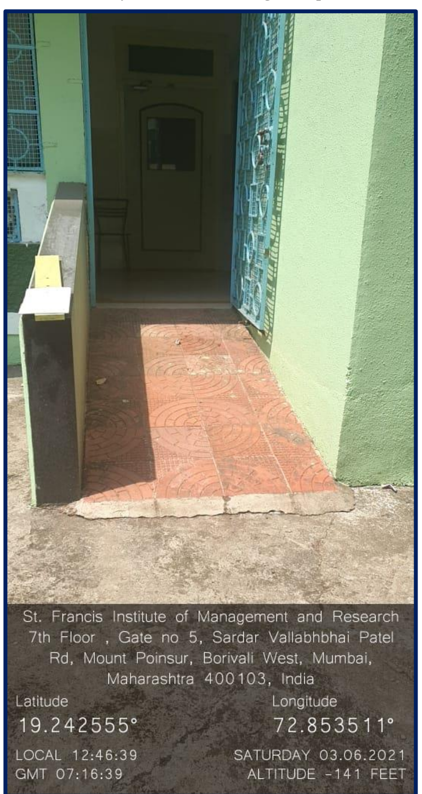
Easy Access to Lift through Ramp