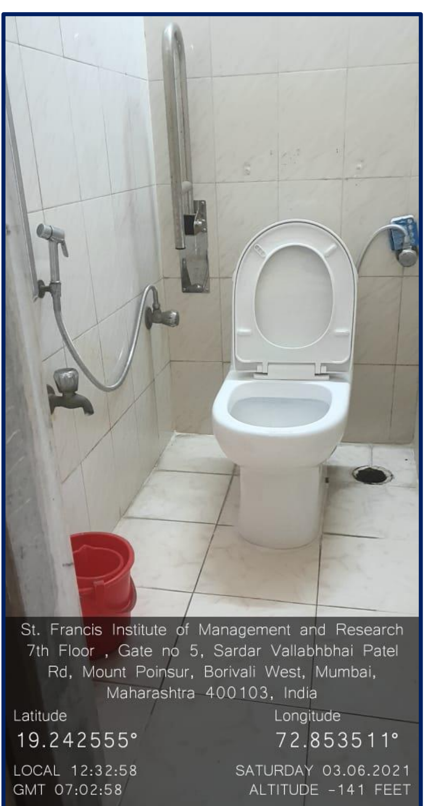
Disabled Friendly Washrooms