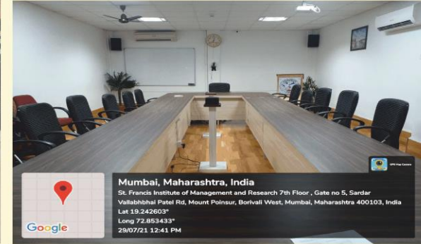
F-106 (MDP Room)