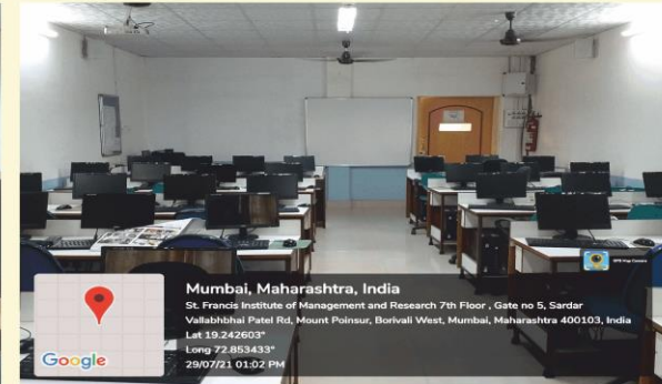
S-209 Computer Lab