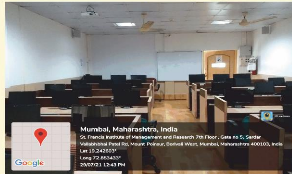
F-109 System Lab