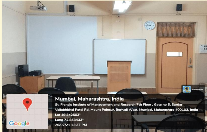
F-102 Tutorial Room