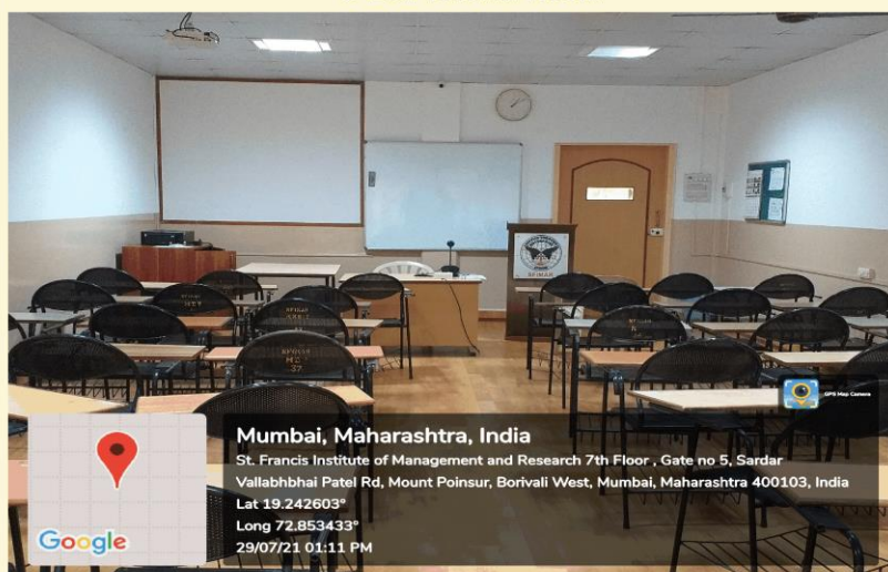
S-202 Tutorial Room