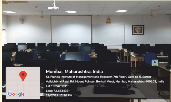
F-105 Computer Room