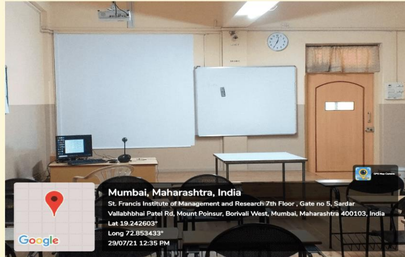
F-103 Tutorial Room