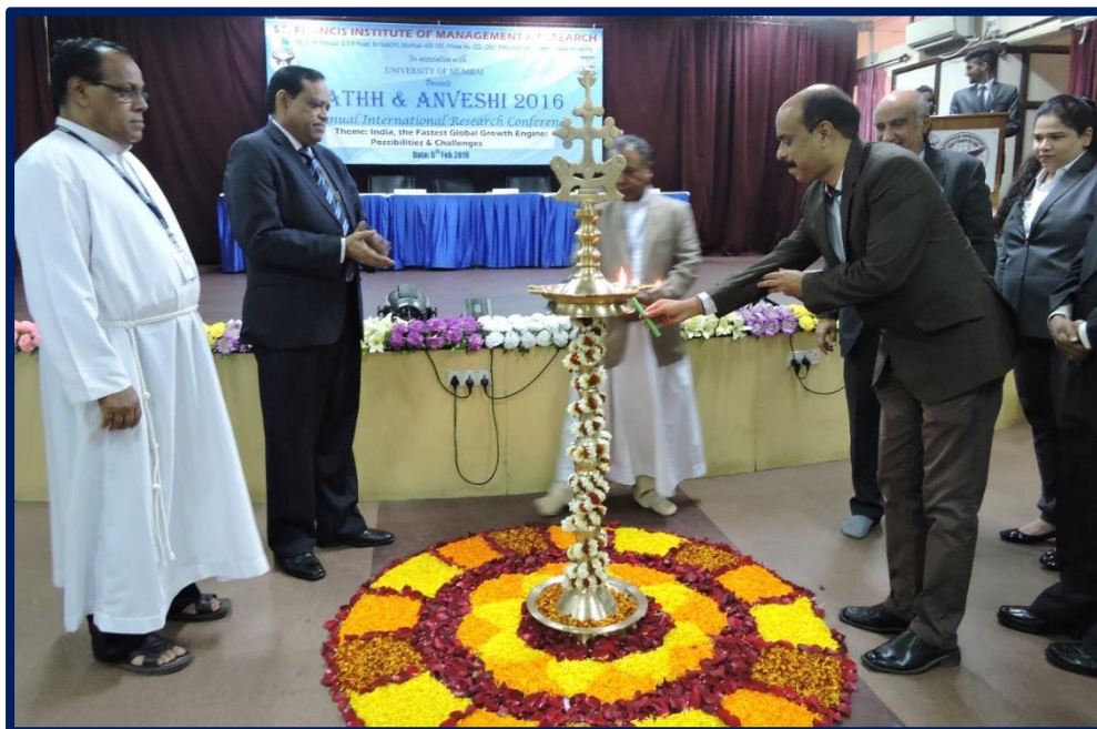
Inauguration of Pathh 2016