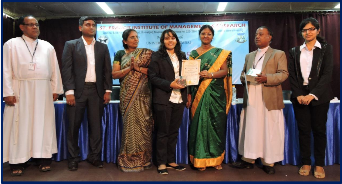
Certificate Distribution Pathh - 2016