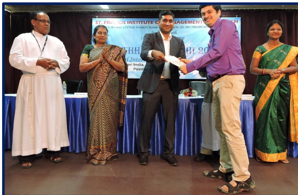
Winner of Pathh 2016