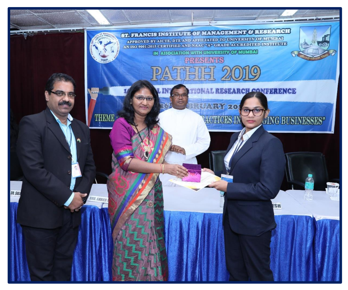
Certificate Distribution - Pathh 2019