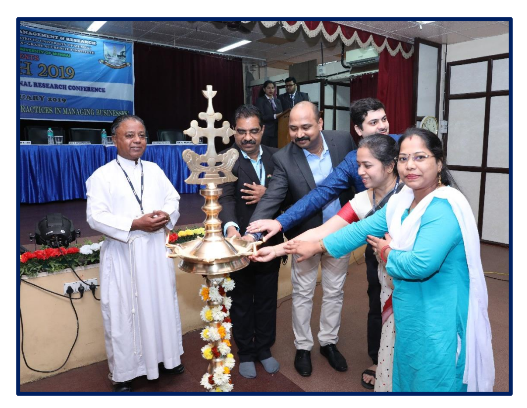
Lighting of the Lamp – Pathh 2019