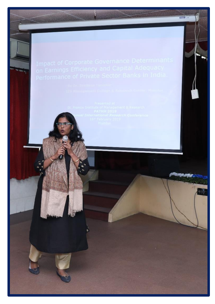
Presentation of Research Paper - Pathh 2019