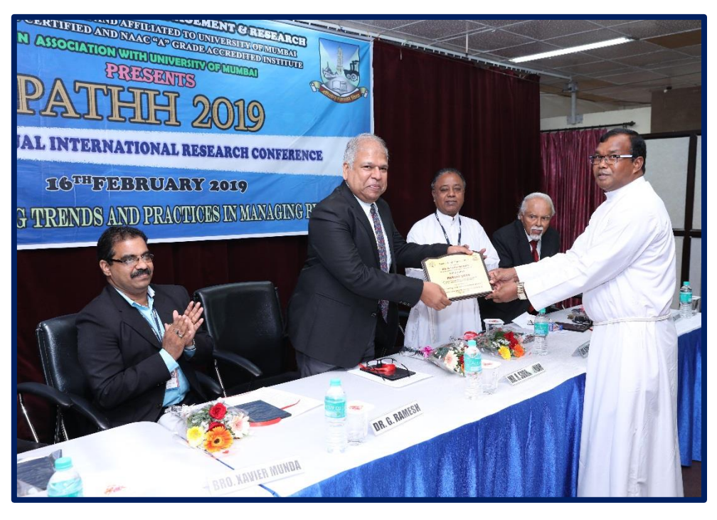
Felicitation of the Guest - Pathh 2019